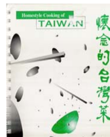
Taiwanese Cook Book