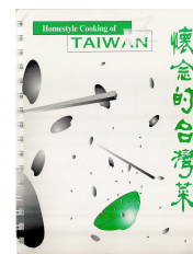
Taiwanese Cook Book